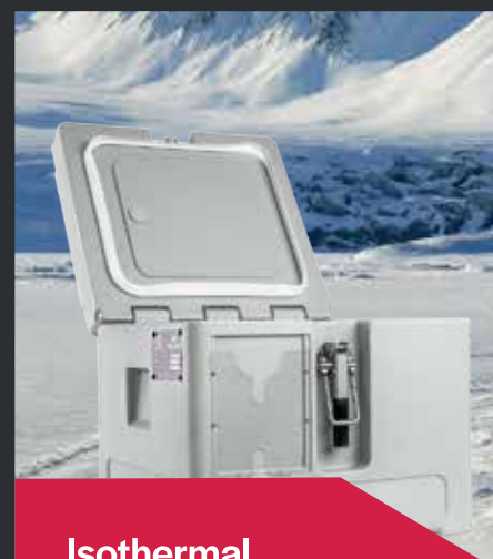
Isothermal containers for dry ice