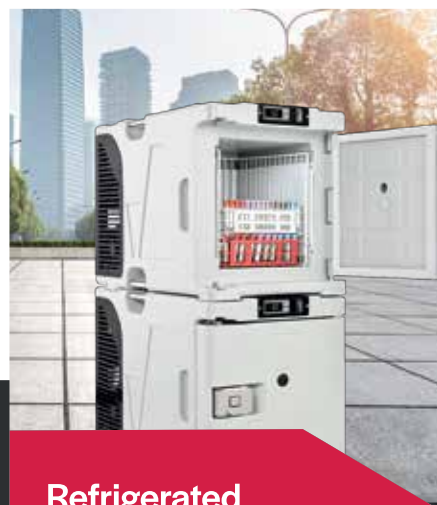
Refrigerated containers, mobile refrigerators