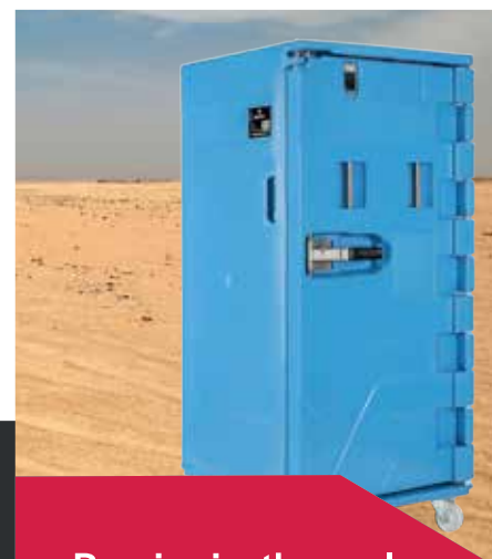
Passive isothermal containers

MEDICAL AND PHARMACEUTICAL SECTOR HO.RE.CA. CATERING DELIVERY LARGE-SCALE DISTRIBUTION (GDO) VENDING MACHINES