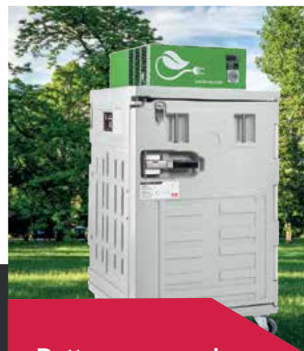
Battery-powered mobile refrigerators