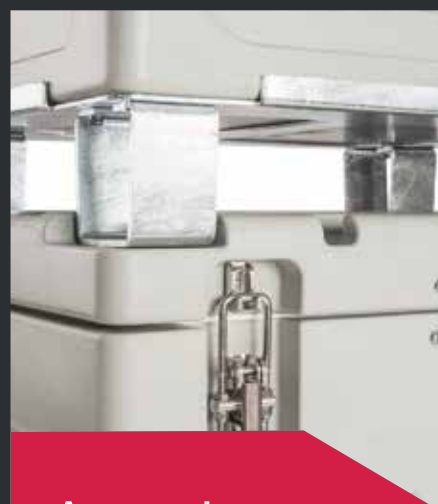
Accessories and spare parts